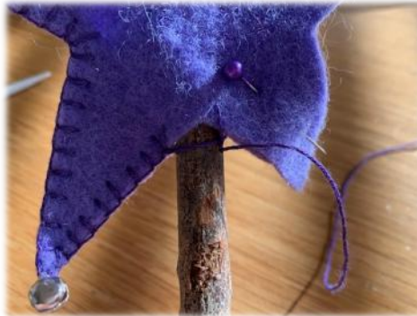
Pull the thread tight.