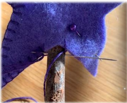
Insert the needle through the hole.

Keep the pieces of felt close in line. You might want to insert some pins to keep the felt matched together.