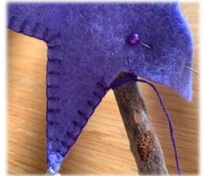
Make a blanket stitch on the other side of the stick as tightly placed as possible to the stick.